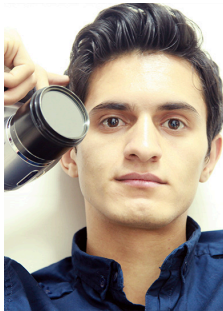
Teymour Ghaderi Filmmaker, Screen Writer (Iran)